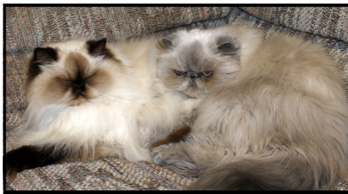
Our Himalayans, Mocha and Misty