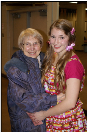
After the play with Grandma

Oh no! Is 2012 almost over already! It cannot be. It's amazing to think of all the things that have happened this year. I've still been doing my sports: Basketball, volleyball, soccer, and swimming. I've had a lot of opportunities to sing for different churches and also at a few events.