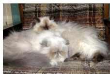
Misty & Mocha

The Christmas season brings for us all a mixture of emotions. As we read your cards and greetings we rejoice with you in your times of joy and celebration this past year. For many, though, your hearts are surely heavy in this Christmas due to losses suffered this year. Even our newspapers give a mixed message—they come stuffed with ads full of good cheer (and “bargains”!) and yet the headlines cry out a harsh reminder that the weary world is not as it should be. Is there true hope to be found?